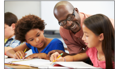
Xacta 360 helps state and local agencies manage cyber risk and compliance in diverse areas such as healthcare privacy, payment card security, student records, sensitive federal data, and others.

The state and local agencies now using Xacta join a host of federal civilian agencies, branches of the armed forces, and the U.S. Intelligence Community in gaining control and visibility into their cyber environment. Available as a cloud-based or on-premises solution, Xacta 360 is the premier choice for cyber risk management in public-sector environments where security is critical and compliance is often mandatory.